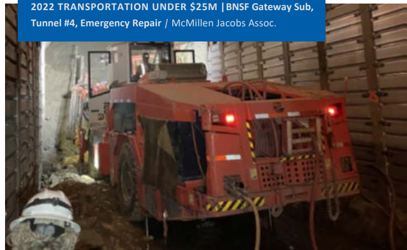
2022 TRANSPORTATION UNDER $25M | BNSF Gateway Sub, Tunnel #4, Emergency Repair / McMillen Jacobs Assoc.

The winners will be contacted directly after the Awards Review Committee has made its final decision so that awardees can make arrangements for the project team participants to be present at the awards ceremony.